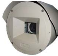
WW-EXF (Mylar motorised glass cleaning device)