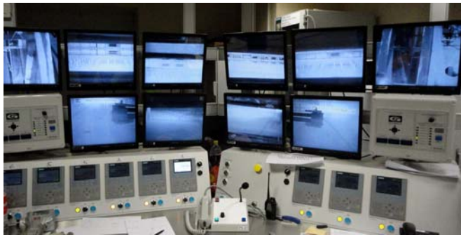
Example of Installation of water-cooled camera control panels and video monitors.