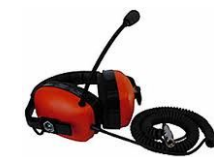
Part 100-02-0598-001 (Headset)