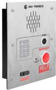
Model 398-001 One button handsfree with keypad