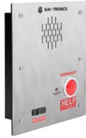
Model 397-001 One button handsfree