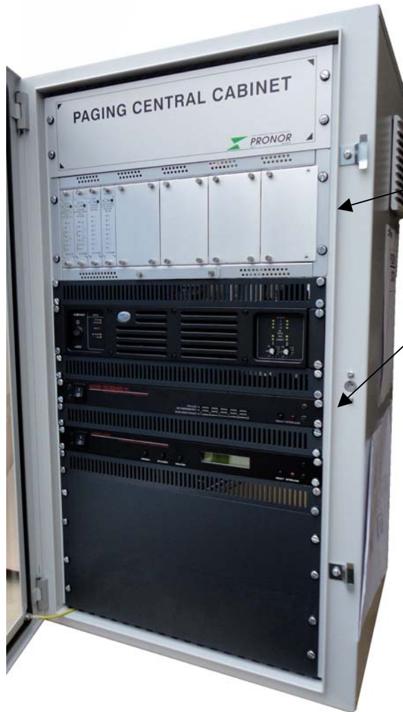
Wall mount Public Address cabinet (Shown Class D- digital audio power amplifier 2x400Watt/100V)