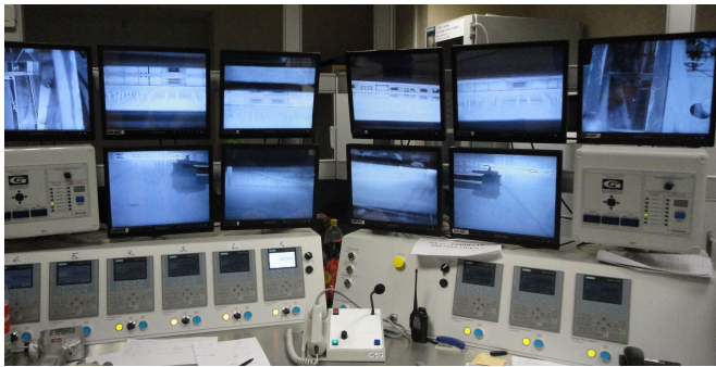
Example of Installation of water-cooled camera control panels and video monitors.