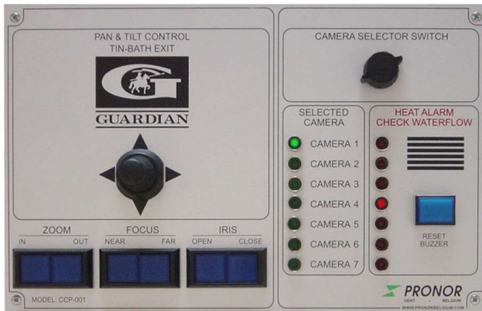
Model CCP- 001 Tin bath camera control unit (Right side panel. Left side panel will have same layout.)